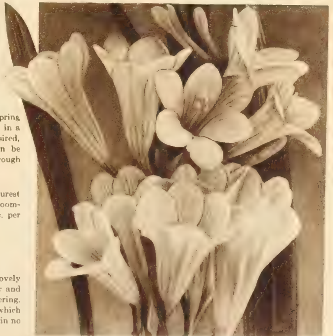
THE "FARDEL" COLORED FREESIAS

Grand Duchess. A California variety of great beauty; of dwarf sturdy growth throwing large exquisite flowers well above the foliage. Extremely free flowering from November till June. Price for either White, Pink, or Lavender , 5c. each; 50c. doz.; $2.50 per 100. Postpaid.